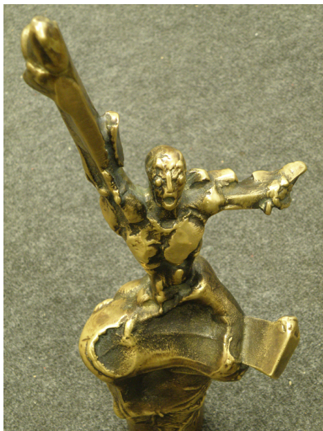
The Janusz A. Zajdel Award trophy

Why do I consider it the most important award in the field in Poland? That is a tough question! For one, it is old. It was originally given in 1985 for the works from 1984 while Śląkfa (award of Silesian SFF Club) is one year older. I think that the importance is related to a few facts. It is an award of fandom. Zajdel is not limited to any particular club or region. Although the number of voters is not very high (I believe around 300 in recent years), anyone can feel it is “their” award. Many people view it this way. Another factor is the relationship to our national convention – Polcon. For years it was the most important