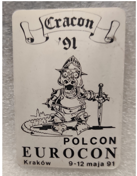
A pin from the Eurocon 1991 in Kraków.

I haven't found any indication about conventions organized in Kraków prior to the Cracon'91. It may have been the first convention in our city. I am not fully sure but fans who remember those times do not recall anything prior. The event was formally organized by a young club – Krakowski Klub Fantastyki (SFF Club of Kraków). In the programme book (or rather a souvenir book?) they put descriptions of many Polish SFF Clubs, including themselves. The description suggests that there were for-