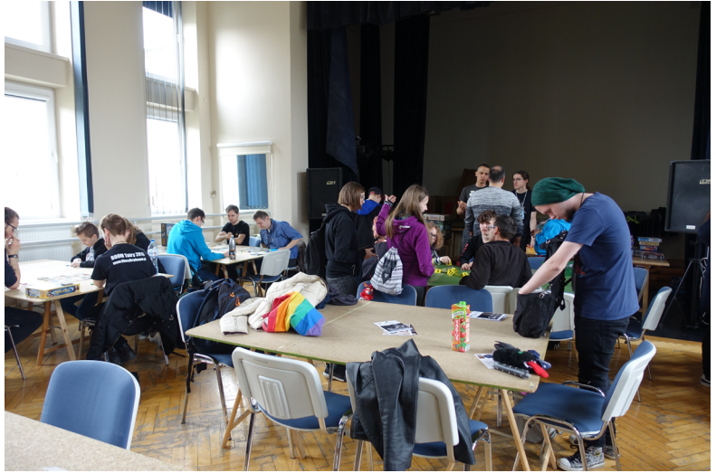
Games room during Lajconik 2019.

in other places. This was the case for years. There is a group of “travelling fans” and a way bigger local community that appears only at local cons. Kraków is not unique in this regard. I have seen similar tendencies in other big cities in Poland, yet I suppose it may be true for some other countries too.