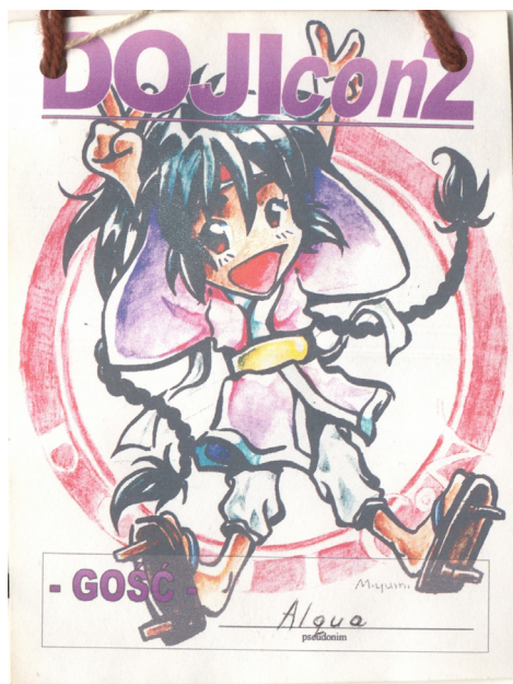
A badge from DOJIcon 2 – manga & anime convention from 2002.

Fanów Fantastyki (Galician Guild of SFF Fans). Imladris continued the “tradition” of being resurrected and it came back in 2013 thanks to the Historia Vita Foundation. It is luckier than Krakon. The revived con received rather positive responses and is still organized yearly. In fact, Imladris 2022 was hosting Polish natcon – Polcon.